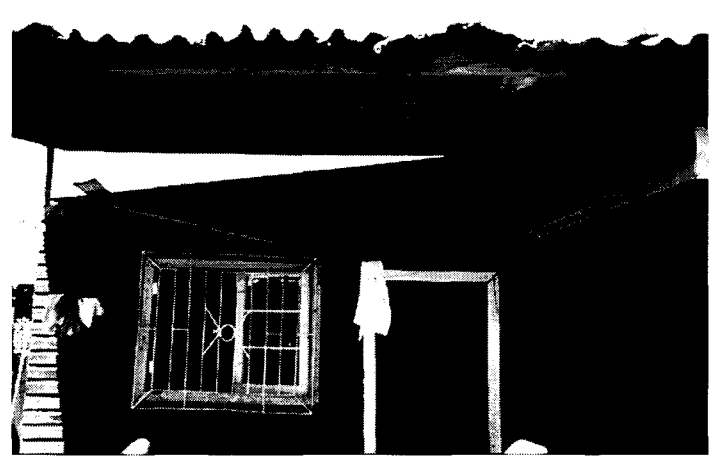
Figure 2. This image shows, to the right, the reinforced brick sanitary unit of a "Caseta Sanitaria" housing. The roof is part of a social program called "Operacion Techo" (roof operation) in which different neighbor families participated in a savings and acquisition of material program that lasted 6 months.

The "Casetas Sanitarias" program, developed by the Pinochet government, became the standardized solution for housing of the urban poor for almost two decades in Chile. The program consisted of lots averaging an area of 100 square meters connected to sewage and water