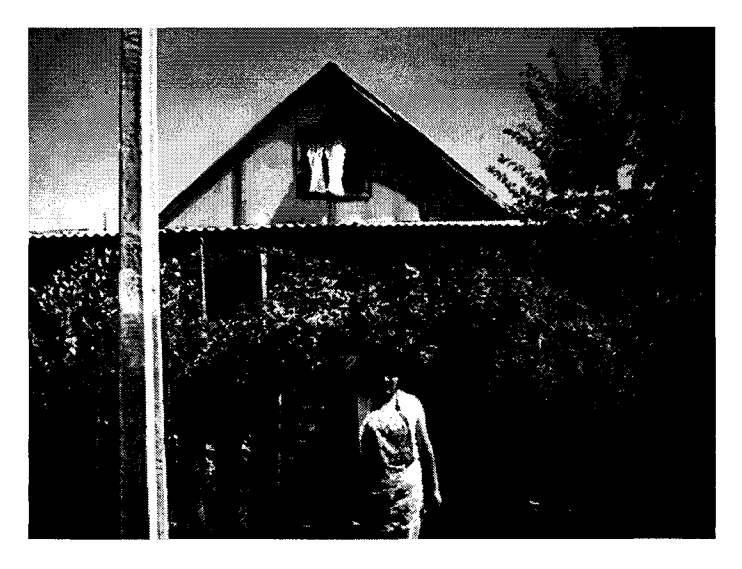
Figure 3. An exceptionally successful participant of the "Casetas Sanitarias" program build a two story self-help house around the sanitary unit.

process of capacitating, management of resources, organization and the search of a sponsoring institution. In the second and third stages, the groups focus specifically on the improvement of group functionality. Actions are directed to the achievement of productive activities, and organizing group chores. The organizational support from the external agent was directed toward the groups' cohesion and resolution of conflicts through the use of dynamic participative techniques. At this stage, it was critical to have a clear proposition for each group. Major proposals like "roof replacement," or "exterior walls," and other smaller tasks to maintain motivation like collective buying of Christmas gifts, or clothes must be stated. Another strategy is to generate new alternatives to increase collective savings; some examples are the creation of stands for selling food, or the collection and selling of newspapers, cans, and bottles. Groups, through this process, learn how to manage their resources and improve their skills by contacting outside institutions. Our observations suggest the process requires a large initiative from the external agent. Therefore many of these projects' success or failure depends highly on the effort and personal skill of the NGO or agency involved.