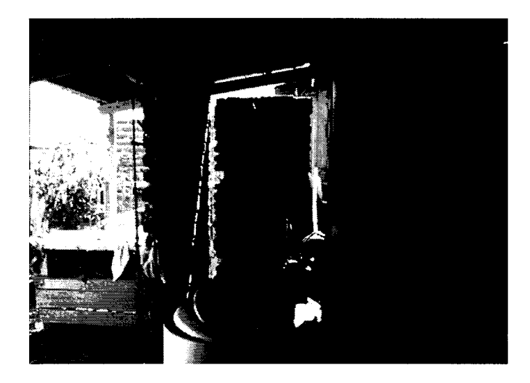
Figure 4. A typical image of the constant re-construction process inside the self-help housing "Casetas Sanitarias" program.

• Simplicity and Adaptability: It allows for construction according to individual needs. It requires very little technological assistance, making expansion of the dwelling very easy once the skill has been learned.